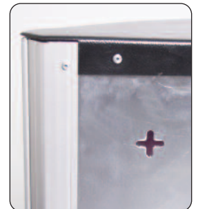
Screw ports for wall mounting