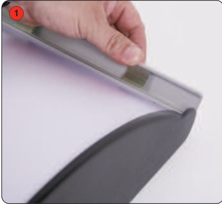
Open out both snap frame sides.

Before assembling or changing graphics ensure the unit is disconnected from the power supply.