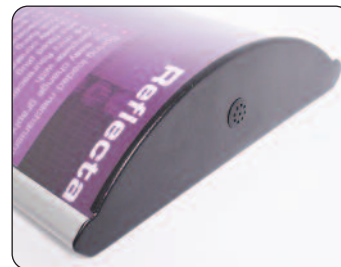
'D' shaped profile