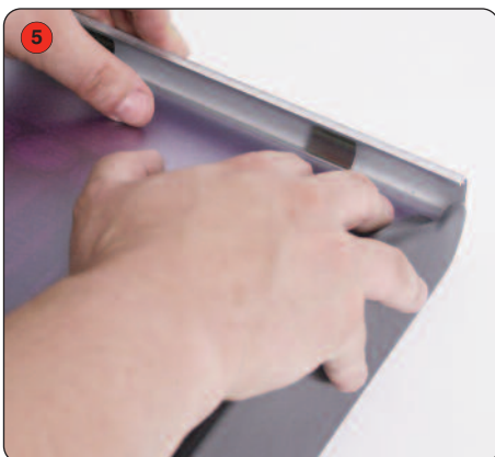
Close the snap frame sides to secure the graphic into place.