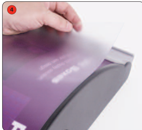
Re-fit the protective sheet over the graphic.