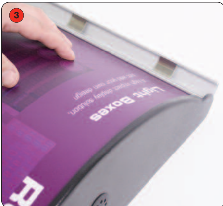
Fit the graphic into the lightbox.